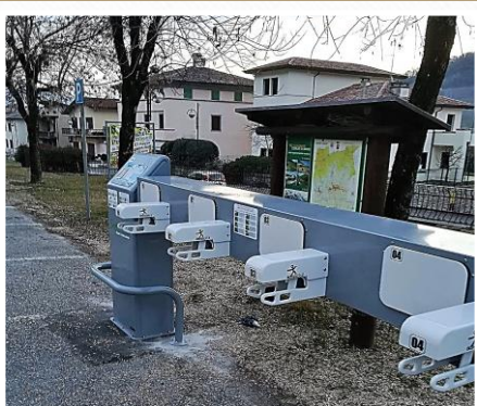
Station for sustainable mobility and e-bikes