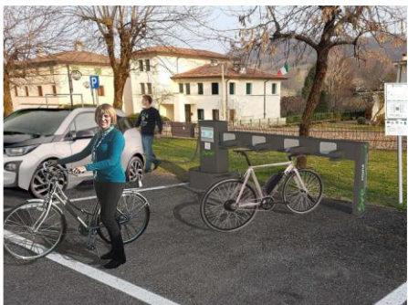
Electric charging station